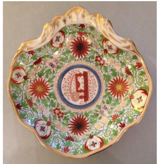
From the Edith & Alfred Susskind Porcelain Collection